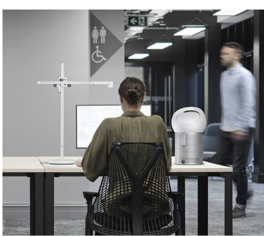
SGBC WEBINAR ENHANCING WORKPLACE HEALTH 14 JULY 2020, 3PM - 4PM