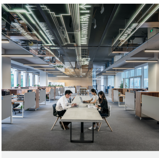
SGBC WEBINAR HOW CLEAN IS CLEAN? 21 JULY 2020, 3PM - 4PM